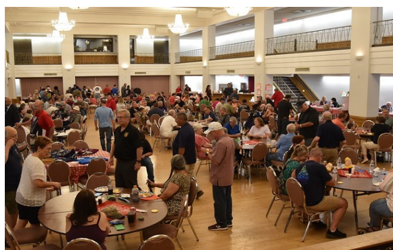
Attendees at the 2022 Indoor Picnic