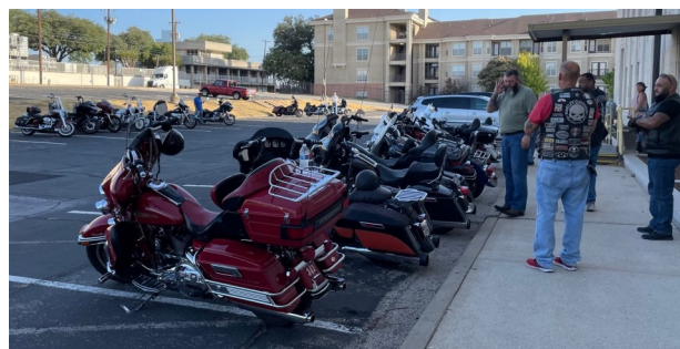
Early Fun Ride Registrants

Fifty plus riders took part in the 135 Mile Fun Run with stops at Phoenix Lodge No. 275 in Weatherford Texas, Mineral Wells Lodge No. 611, and Santo Lodge No. 836. The Brothers of each lodge treated the riders to refreshments and fellowship. Riders drew cards at the start and finish of the lodge and at each lodge on the circuit competing for the best poker hand.